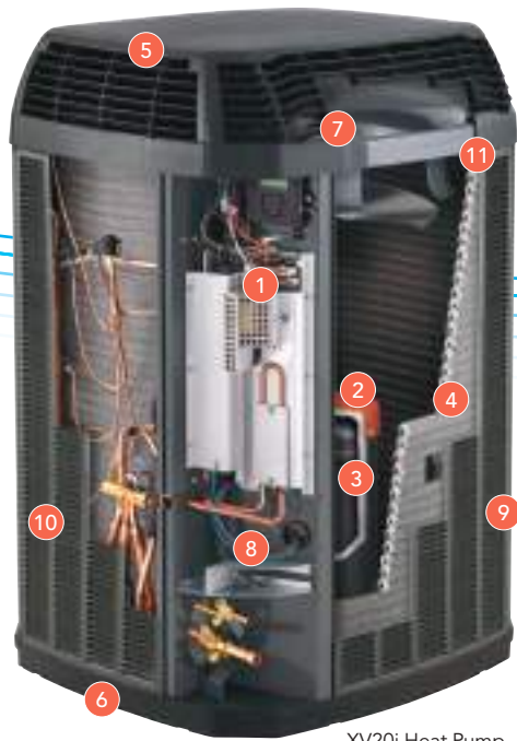
XV20i Heat Pump